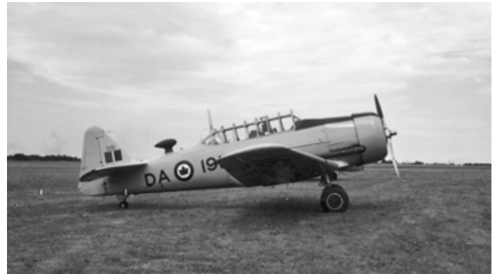
Harvard MkII, 3191 Postwar. Today C-FMTX