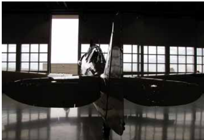
Vintage Wings Harvard