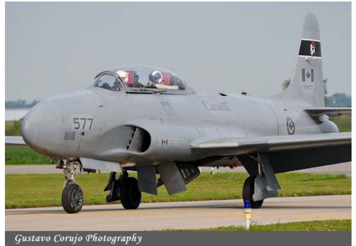
(Above) Canadair CT-133 from Jet Aircraft Museum

business that day and every day, and we thank him for that. The following is a list of those who contributed directly but doesn't contain the other just as important nameless cadets, scouts, service workers, fire, police and the like. Suffice to say that if we want to continue to grow and prosper the overwhelming message here is that we will need each other more than ever.