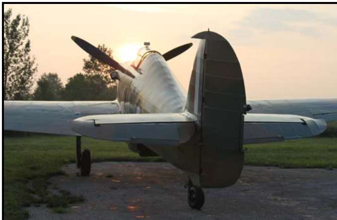
A Hurricane sunrise.....

149 Thames St.,S, Ingersoll - 519-425-5353 - www.GrampasAttic.CA Email: Grampa@GrampasAttic.CA