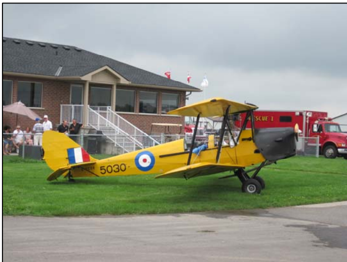
CHAA's de Havilland DH 82-C Tiger Moth