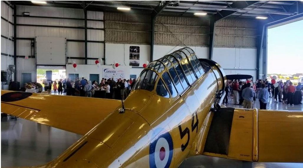
Our own 3830 on display at the VIP Gala for the Great Lakes International Air Show on Friday, June 17.