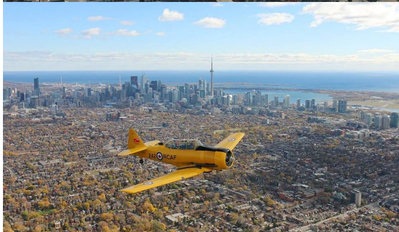
At right, the “Missing Man” manoeuvre over the Veterans Wing at Toronto’s Sunnybrook Hospital.