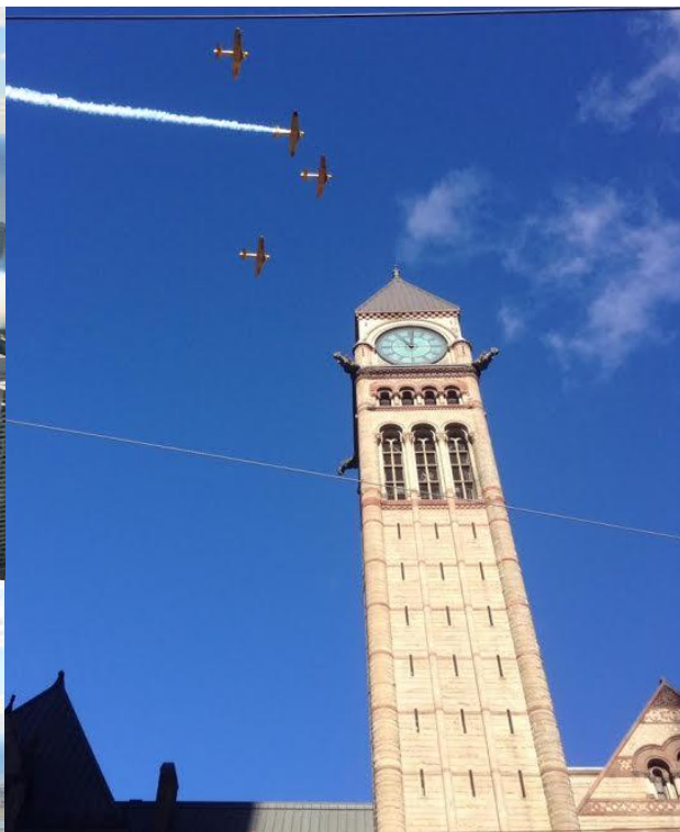
Above, Harvards flying over the Old City Hall Cenotaph in downtown Toronto.