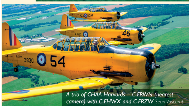
A trio of CHAA Harvards – C-FRWN (nearest camera) with C-FHWX and C-FRZW

The Canadian Harvard Aircraft Association (CHAA), based in Tillsonburg, Ontario, is marking its 40th anniversary in 2025.