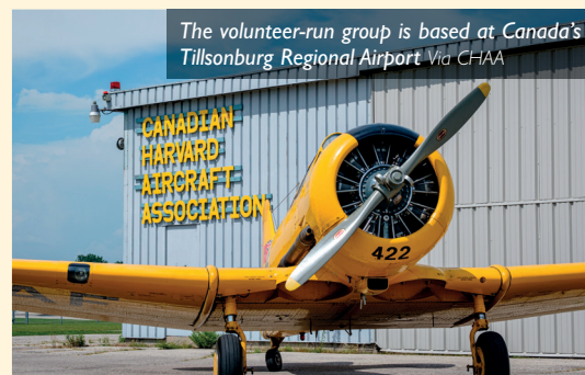
The volunteer-run group is based at Canada's Tillsonburg Regional Airport.

CHAA plans to host several special events during this anniversary year. See: www.harvards.com